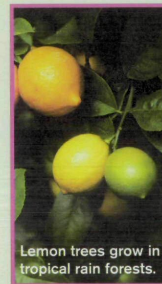
Lemon trees grow in tropical rain forests.

Many medicines are made from rain forest plants. Today, scientists are studying the plants to find new medicines to cure diseases.